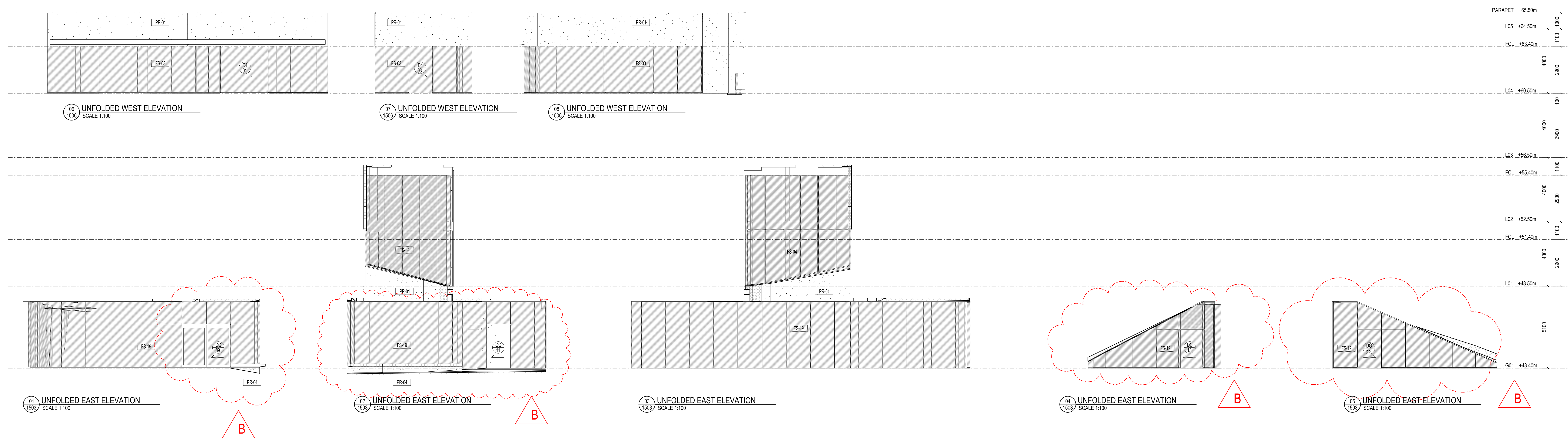
06 UNFOLDED WEST ELEVATION SCALE 1:100